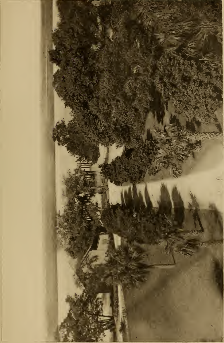
ROAD TO BOAT LANDING